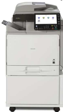
(※) The photo shows the product with an optional Cabinet (※) attached. The environmental load of the optional unit is not included in the results.

Environment Contact: RICOH Company, Ltd. Corporate Communication Center email : envinfo@ricoh.co.jp