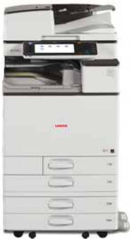
(※) The photo shows the product with an optional Paper Feed Unit (※) attached. The environmental load of the optional unit is not included in the results.

※Figures in ( ) indicated environmental impact including recycle effect *note3