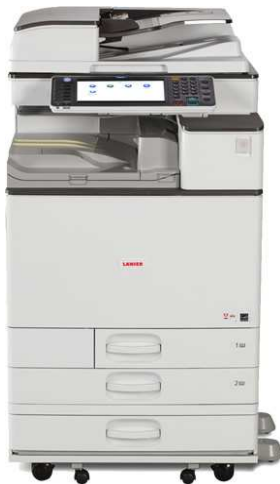
(※) The photo shows the product with an optional Paper Feed Unit (※) attached. The environmental load of the optional unit is not included in the results.

※Figures in ( ) indicated environmental impact including recycle effect *note3