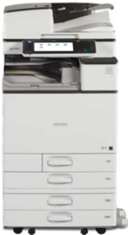
(※) The photo shows the product with an optional Paper Feed Unit (※) attached. The environmental load of the optional unit is not included in the results.

※Figures in ( ) indicated environmental impact including recycle effect *note3