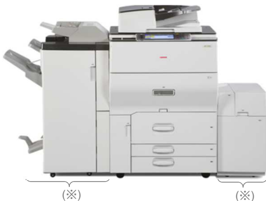
The photo shows the product with optional units (X) attached. The environmental loads of these units are not included in the results.

※Figures in ( ) indicated environmental impact including recycle effect *note3