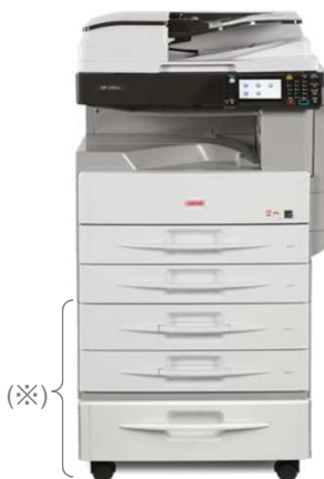
The photo shows the product with the optional units (※) attached. The environmental loads of the optional units are not included in the results.

※Figures in ( ) indicated environmental impact including recycle effect *note3