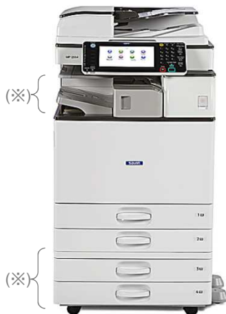
The photo shows the product with the optional units (X) attached. The environmental loads of the optional units are not included in the results.

※Figures in ( ) indicated environmental impact including recycle effect *note3