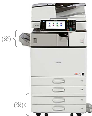
The photo shows the product with the optional units (X) attached. The environmental loads of the optional units are not included in the results.

※Figures in ( ) indicated environmental impact including recycle effect *note3