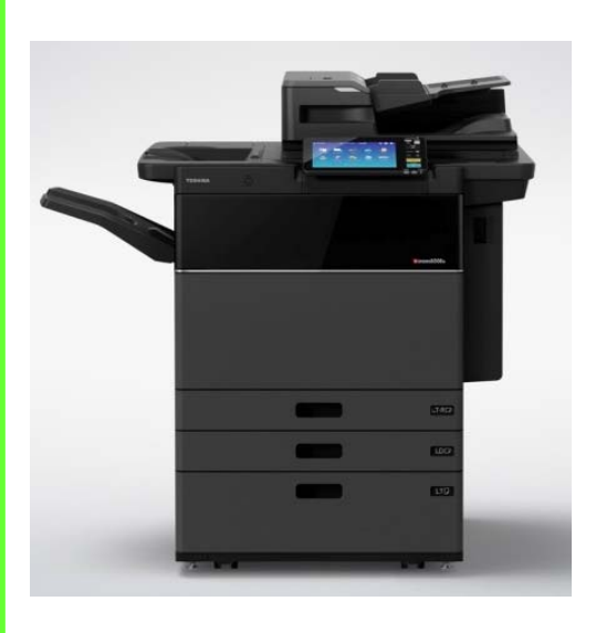
2 Drawer + Tandem LCF (LCF: Large Capacity Feeder)