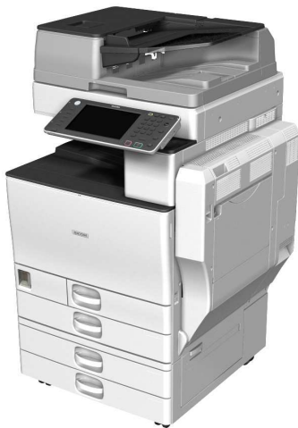
The photo shows the Aficio MP C4502 with the Paper Bank Unit (option) attached.

Environment Contact: RICOH Company, Ltd. Corporate Communication Center email : envinfo@ricoh.co.jp