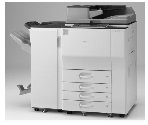
The photo shows the Aficio MP 7502 with 2,000-Sheet Finisher SR4070 (option) attached.

%Figures in () indicated environmental impact including recycle effect *note3